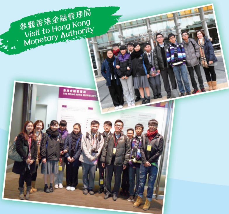
參觀香港金融管理局 Visit to Hong Kong Monetary Authority