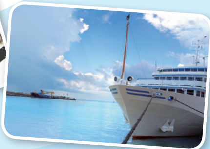
郵輪服務 Cruise Services