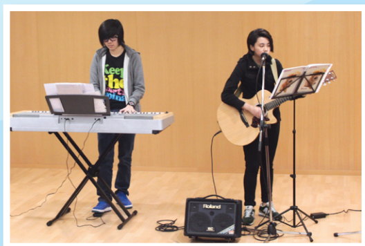
SAO 籌辦的午間音樂會，為愛好音樂的同學提供表演平台。 SAO organized lunchtime concerts for students to showcase their musical talents.