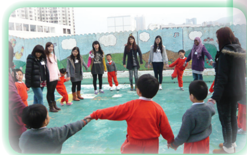
幼兒教育高級文憑 Higher Diploma in Early Childhood Education

The Institute's Diploma, Yi Jin Diploma and Higher Diploma programmes are registered under the Qualifications Framework as Level 3 and 4 programmes. Some overseas degree programmes are registered as QF Level 5 and enjoy similar status of local programmes.