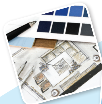
室內設計 Interior Design