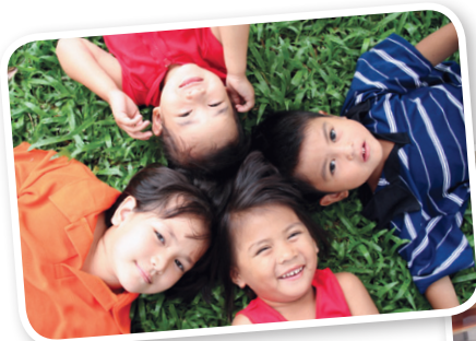
幼兒教育 Early Childhood Education

The semester is coming to its end. Do you feel a little anxious about your study path ahead? To emerge from the crowd in this highly competitive world, you need a programme that secures quality, recognition and career prospects. Read on and you will know LiPACE is the right place for you.