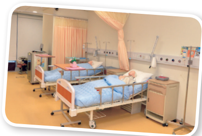
護理學 Nursing Studies