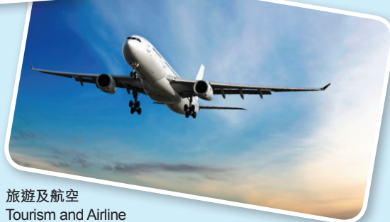
旅遊及航空 Tourism and Airline