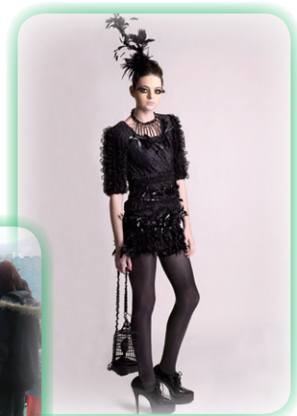
時裝學高級文憑 Higher Diploma in Fashion Studies